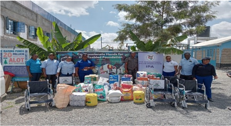
IPA Kenya members and local Police representatives present the donations

On 16 December 2022, the International Police Association (IPA) in partnership with the National Police Service visited the Compassionate Hands for the Disabled Foundation in Ruai, Nairobi. The home houses 104 children, all of whom are differently abled.