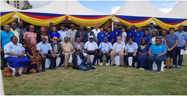
IPA Kenya members attending end of year friendship day

The 3 rd of December, 2022 was a special day in the IPA Section Kenya Calendar. Members from all eight regions gathered together at the Police Pavilion in South C, Nairobi to take part in the Annual Friendship Day. The last time a similar event was held was in December, 2019, thanks to the Covid-19 pandemic. Now that members had the opportunity to meet again after such a long time, they came in their numbers.